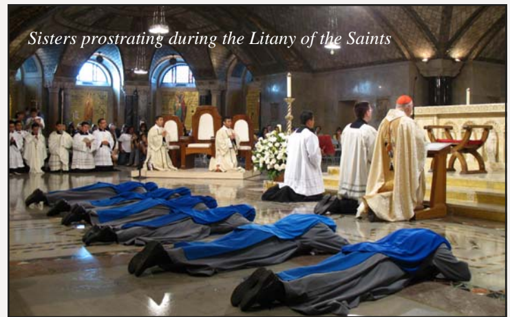
Sisters prostrating during the Litany of the Saints