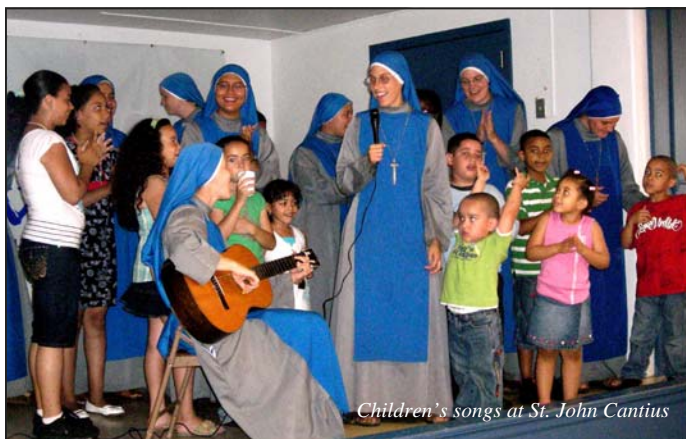
Children's songs at St. John Cantius

One of the many graces of the mission came to a man who had been Catholic for many years but had been unaware of the Real Presence of Jesus in the Holy Eucharist. However, when this truth of our faith was explained to him, he believed immediately with confidence and was literally brought to his knees in the presence of the Blessed Sacrament. Indeed, this is the purpose of the popular missions: to bring men and women closer to Christ in a very real encounter with Him, especially through the sacraments. We thank God for this time of grace and entrust to His care the parish family of St. John the Baptiste de la Salle.