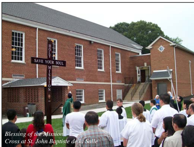
Blessing of the Mission Cross at St. John Baptiste de la Salle

After each morning's Holy Hour and Mass, the missionaries began the rigorous schedule of door-to-door house visits, oratory for children, youth group activities, special visits to the sick and the elderly, daily Rosary procession through the neighborhoods, and